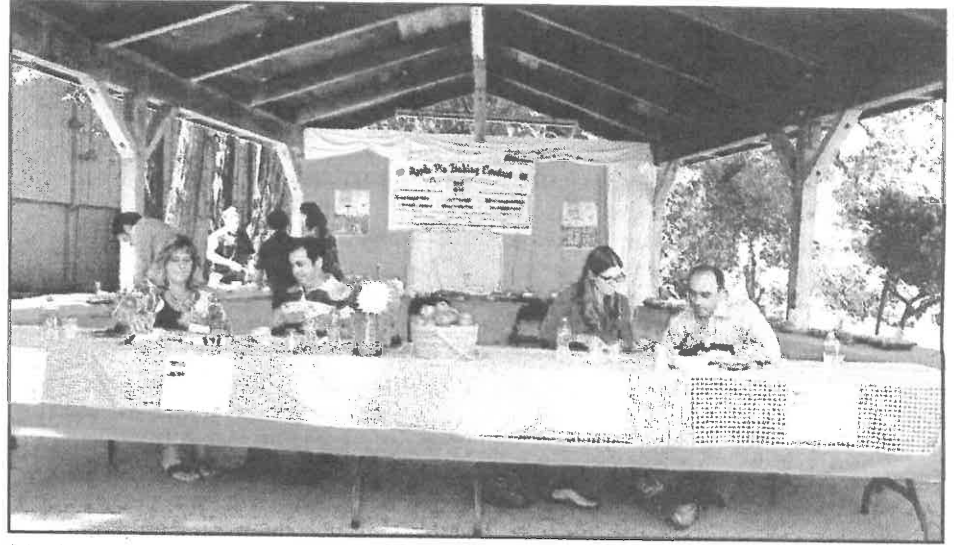
Attendees await the judge's decisions at the 2015 Apple Pie Baking Contest.

Vista Ave., Watsonville. There is no entry fee for this popular opening day event.